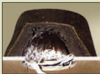
Results after fire

There's no question that can lights are a great way to provide lighting for a media room, living room or kitchen. Finally, there is a reliable, effective solution that is easy to install. Privacy Fire Rated Recessed Light Covers are the answer.