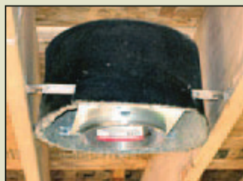
Installed Light Cover

STOP NOISE LEAKS AND MEET THE FIRE CODE FIT RESIDENTIAL AND COMMERCIAL FIXTURES INSTALLATION IN MINUTES, NO FABRICATION