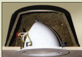
Drop Ceiling (cut away)

The key to a successful soundproofing project is paying attention to the little things. Nothing is more problematic than holes in the sound envelope we have taken steps to create. Recessed lights and speakers are the most common holes in the soundproofing system.